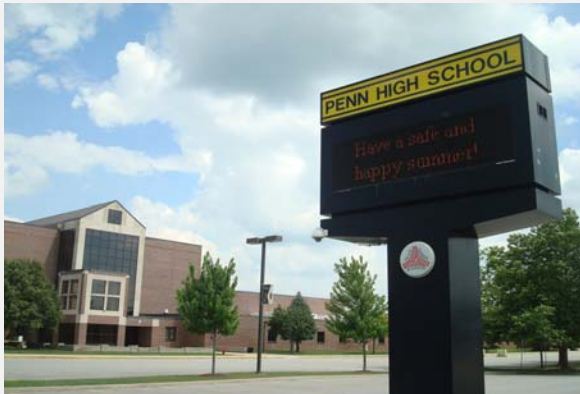
Penn High School Renovation (6000 man-hours created)