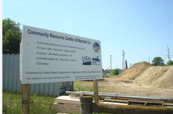
Plymouth Community Resource Center (12,000 man-hours created)