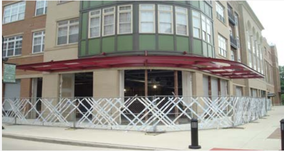
Urban Outfitters-Eddy Street Commons (1,400 man-hours created)