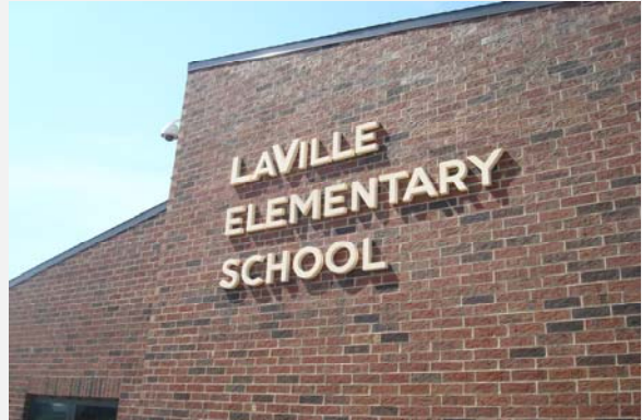
La Ville Elementary School (4,000 man-hours created)