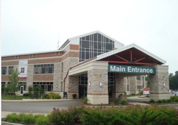
Goshen Hosp., Central Utility Plant (3,900 man-hours created)