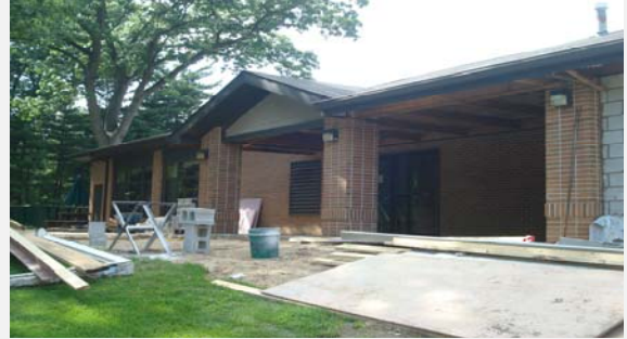
Bethel College-Common Dining Hall (3,000 man-hours created)